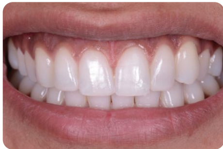
After Enlighten whitening